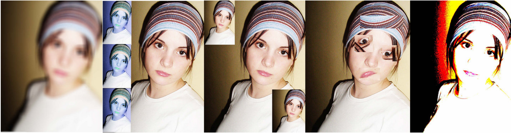
Image Manipulation using Colour Magic